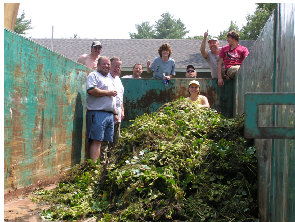
Volunteers fill dumpster full of invasive water chestnuts during the clean up.